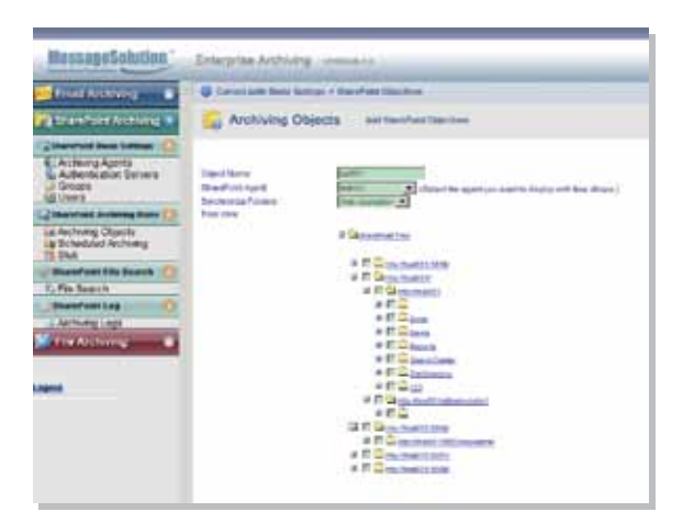
SharePoint Archiving Objects